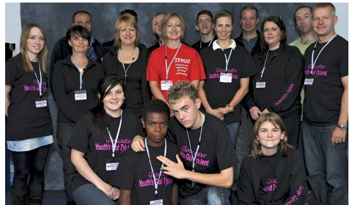
Members of the team who organised the Gloucester Youth's got Talent

All entries will receive a professional photograph of themselves to remember the event.